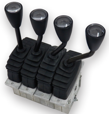
Lever (air) controls