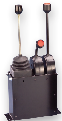
Lever (cable) controls