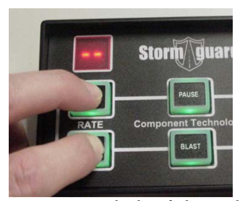
To enter Setup Mode you must press both switches and hold them down until double dash is displayed on Rate Indicator.

To enter the Setup Mode turn off the ignition (this will power down the output module). Push both the Rate increase and decrease switches simultaneously and turn on the Ignition. Remain holding the switches until a double dash is displayed on the Rate Indicator LED. Release the switches and the System is now in the Setup Mode.