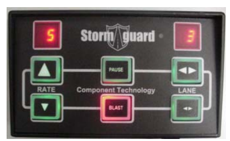
Spreader Module in Blast Mode

The Blast switch will operate the Rate at full output for maximum Auger operation. The Blast switch is configurable to operate as a momentary switch or with a "Timed on Delay" function. The Blast switch will be lit Red when on. To stop the "Timed on Delay" push the Blast switch and the control will revert to the previous running mode. If desired the Pause can be used to stop the Blast process. The Blast time on delay setting is adjustable from 1 to 10 seconds.