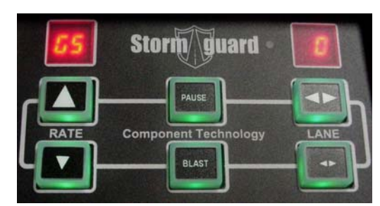
Menu 1 Ground Speed Setup