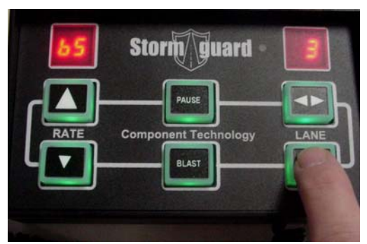
To change menu setting press Lane increase or decrease switch