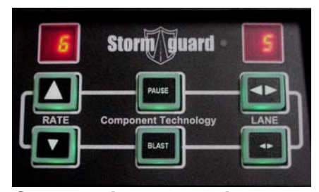
Spreader in the Running Mode

The Rate (Auger) and Lane (Spinner) rate settings are changed by operating the increase or decrease switches. The setting can be selected to the desired rate before the Pause is switched to run.