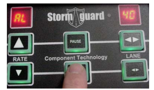
Menu 6 Rate Minimum Trim selection