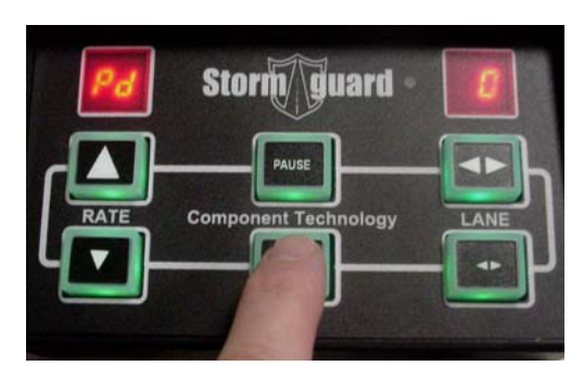
Menu 3 Plow Mode Single or Double acting