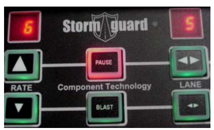
Spreader in the Pause Mode

The Spreader will always show the previous rate setting when in Pause. The control will start at the rate shown on the indicators once the Pause switch is released.