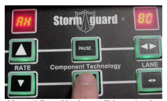
Menu 7 Rate Maximum Trim selection