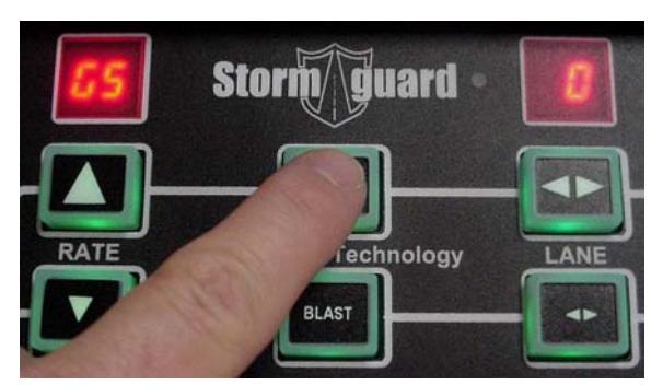
To leave Setup Mode push Pause switch

Note: When leaving the "Setup" mode the control will return to the "Pause" condition. The control is now ready to operate at the new settings.