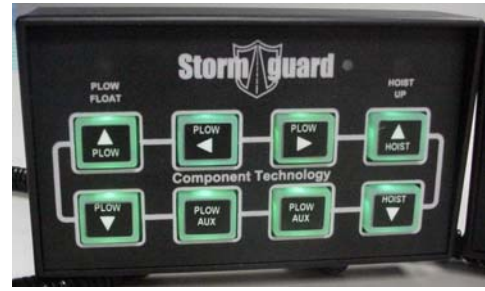
Plow / Hoist Control Module

The Plow/Hoist Control Module consists of eight tactile push to operate switches that include green LED backlighting. The upon switch operation the LED turns Red to indicate operation. The Module includes a Piezo Electric Buzzer for audible indication. The switches are a momentary type operation and must be held to maintain an output. The backlight intensity is automatically adjusted via the ambient light sensor in the face of the control panel. The switches consist of the Plow Up/Down, Plow Angle Left/Right, Plow Fold/Aux Left/Right and Truck Hoist Up/Down functions. A Pilot Valve coil output is simultaneously energized with the other outputs in this control.