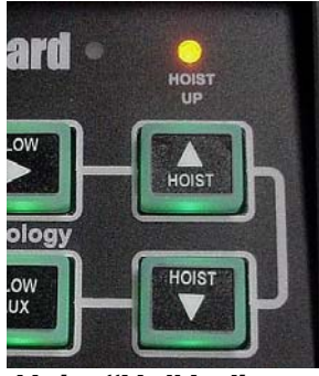
Hoist "Up" Indicator

The Plow Up/Down function includes a Plow Float feature. (Plow Float allows the full plow weight to rest on the ground and allows the plow to follow the road contour.)