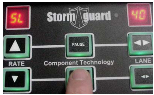
Menu 8 Lane Minimum Trim selection