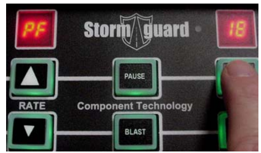
Menu 5 PWM Frequency selection