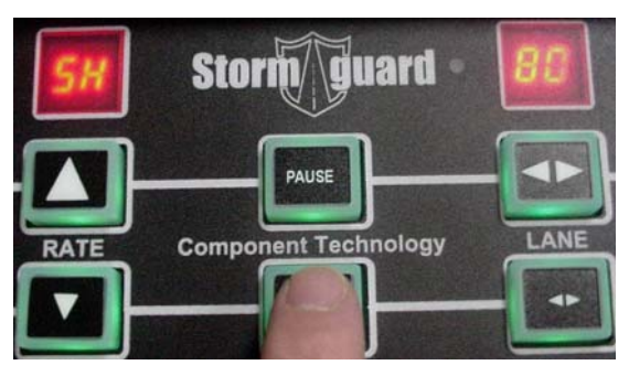
Menu 9 Lane Maximum Trim selection