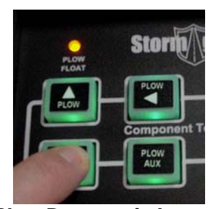
Push and hold Plow Down switch to engage Plow Float

To utilize Plow Float it must first be enabled and a time delay value must be set. Once enabled the Plow Float is engaged by holding the Plow Down switch continuously until the time delay is met at which time the Plow Down output is latched on. When the Plow goes to float the Plow Float Indicator lights and the Plow Down switch light turns red. To release the Plow Float condition, energize the Plow Up switch. In Plow Float the Pilot Valve is NOT energized!