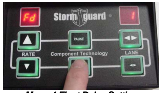
Menu 4 Float Delay Setting