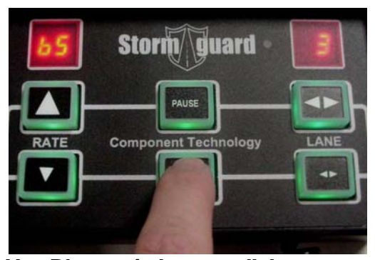
Use Blast switch to scroll thru menus