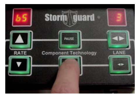
Menu 2 Blast On Time Setup