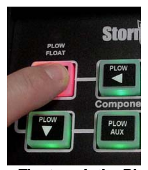
To stop Plow Float push the Plow Up switch