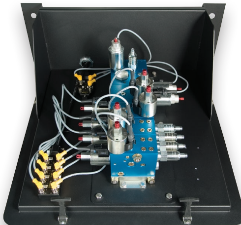
Modular manifold valve assembly