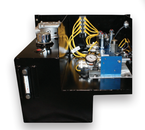
Spreader block enclosure