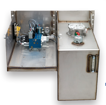
Patrol enclosure with cover

Stainless steel reservoir/enclosure combo