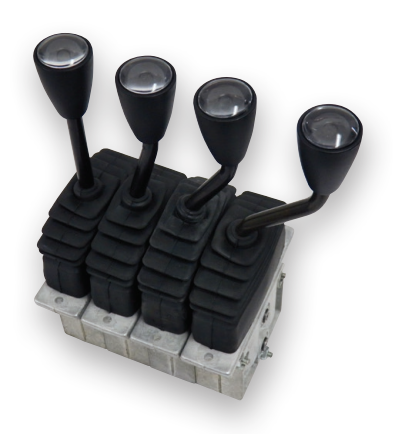
Lever (air) controls