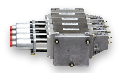
Hydraulic valve with pneumatic (air) actuators